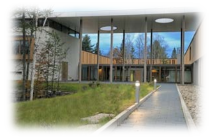
Val Notre-Dame Abbey (St-Jean-de-Matha, QC)